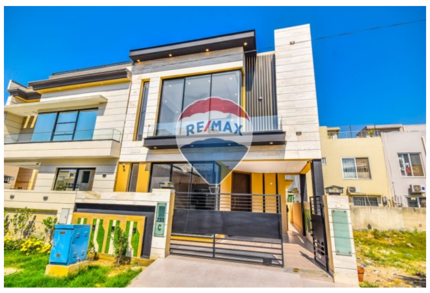
5 Marla Luxurious And Eye Catching House For Sale